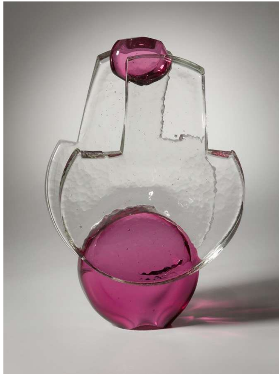
Thoryn Ziemba, Mimic(a) , 2019, blown, cast, cut glass, 20 x 13 x 11 inch