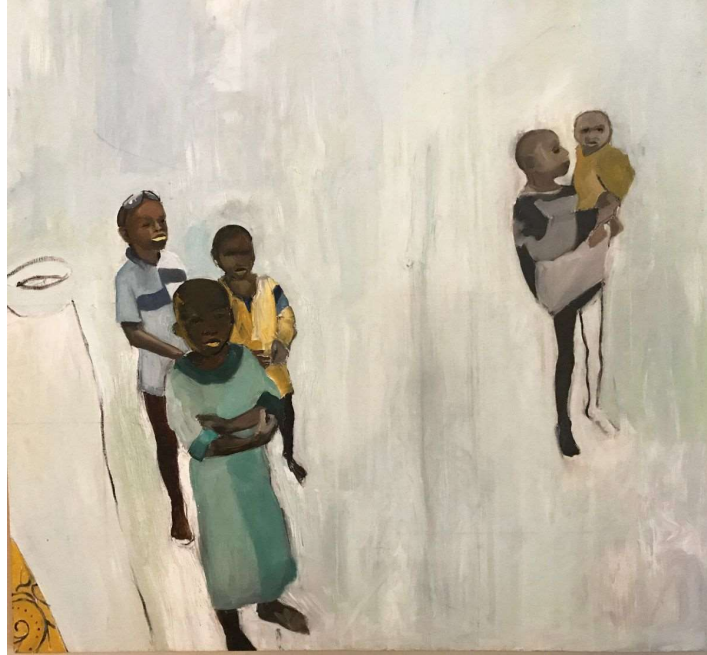
Dimeji Onafuwa, Omolomo (Someone Else's Children) , 2020, oil on canvas, 48 x 48 x 0.5 inches