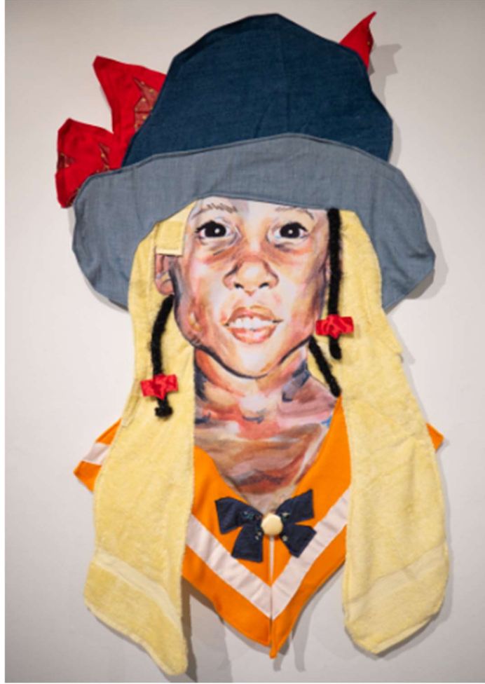
Jasmine Best, Sailor Venus , 2021, ink painting digitally printed on twill, collaged on found fabric, 55 x 33 inches