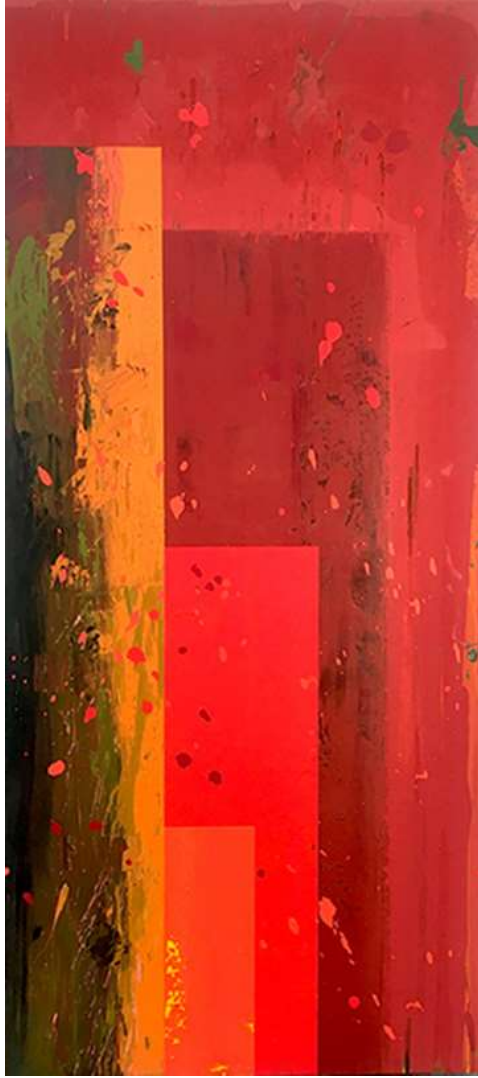
Frank Campion, Taraz , 2019, oil on linen, 84 x 38 inches