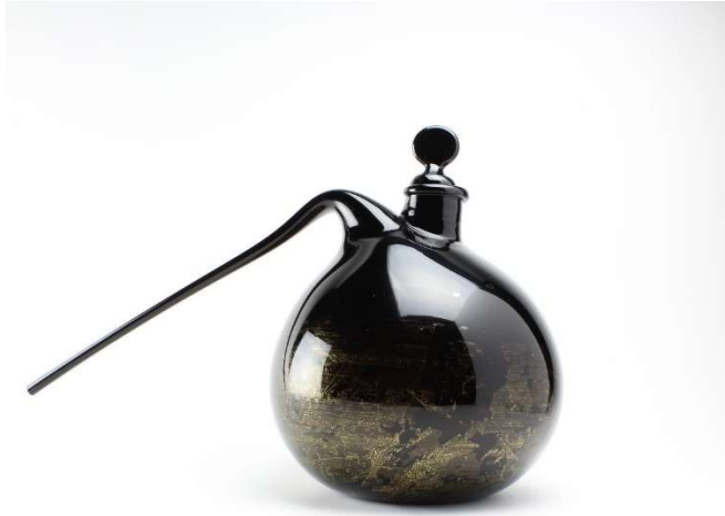
John Shoemaker, Black Retort , 2017, blown glass with 24k gold leaf, 21 x 13 x 10 inches