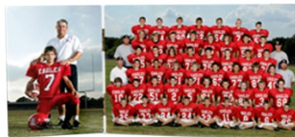
Hinged Memory Mate